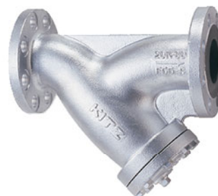
Fig : 20FDYB

3/8-12inch(10-300mm), Approvals : MLIT 10-300 mm (3/8-12 inch), BODY MATERIAL : DUCTILE IRON, COVER MATERIAL : DUCTILE IRON, KITZ